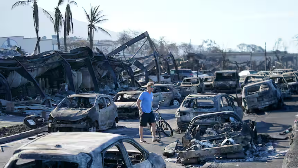
A man walks through wreckage in Lahaina, Hawaii, after wildfires devastated the town on the island of Maui, prompting thousands to flee their homes.