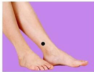
Three Yin Intersection