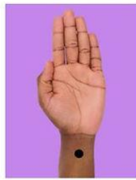
Inner Frontier Gate