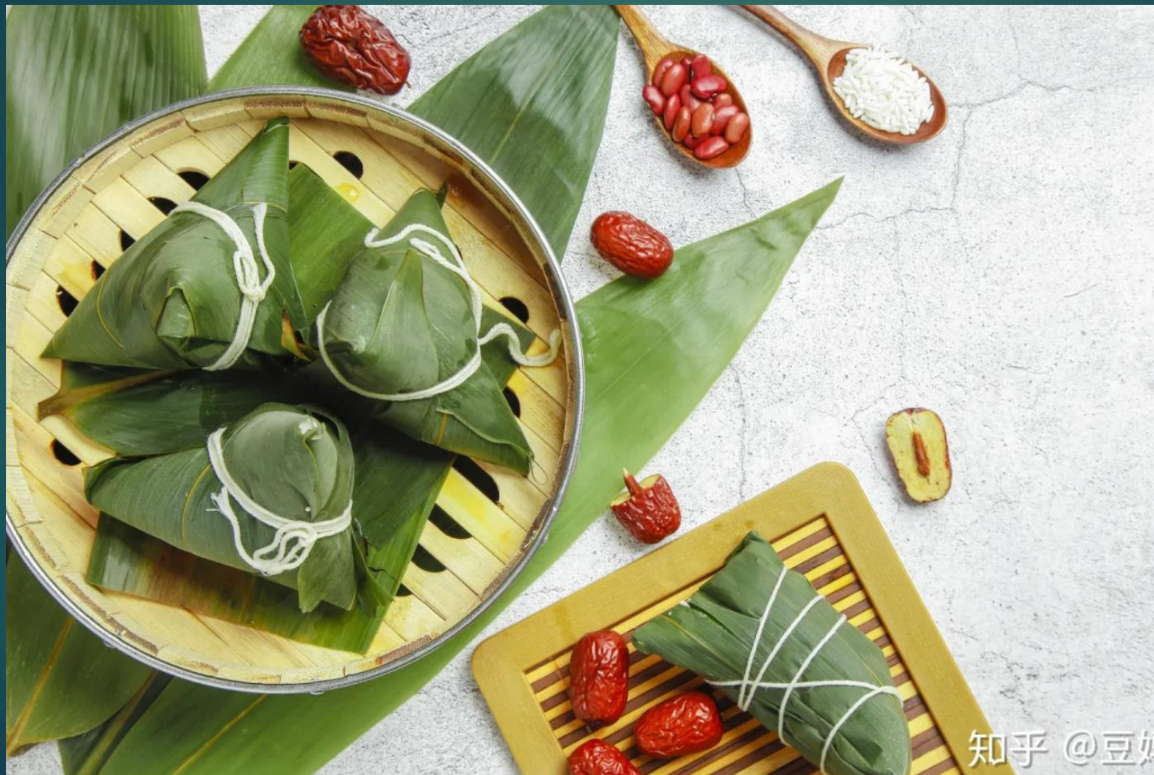
Dragon Boat Festival