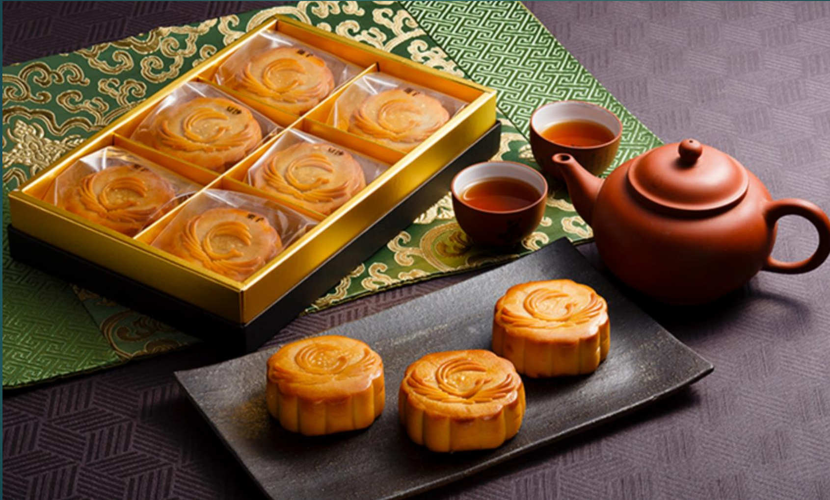
Mid-Autumn Festival / Moon festival