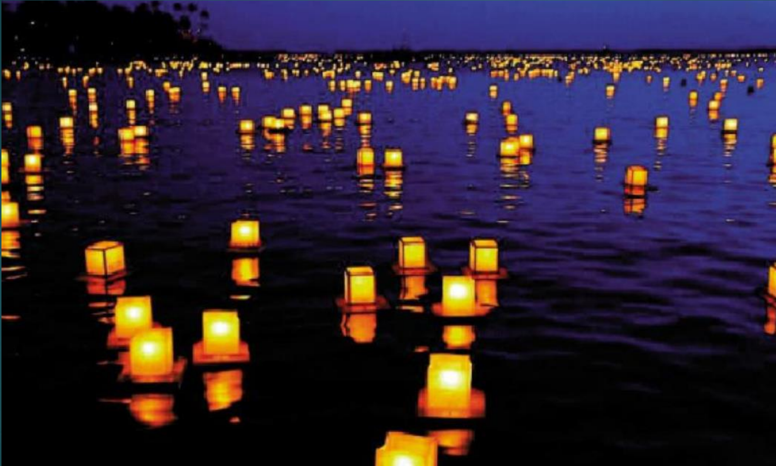
Ghost Festival/ Hungry Ghost Festival