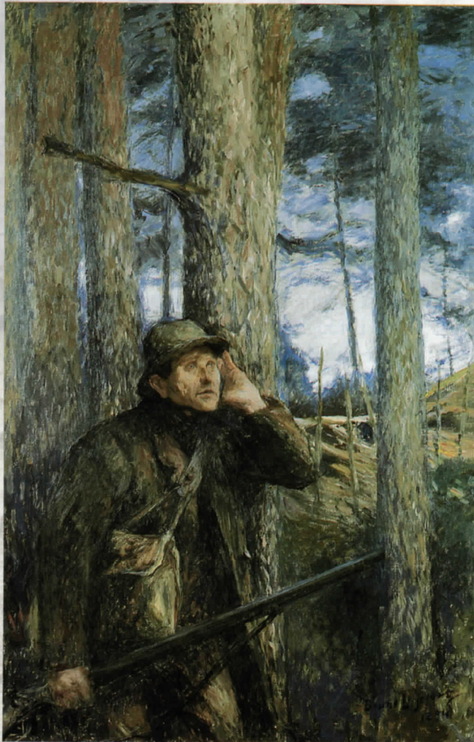
Poacher , 1894. Bruno Liljefors. Oil on canvas, 61 x 41 cm. Statens Konstmuseer, Stockholm.

IN A FOREST of mixed growth somewhere on the eastern spurs of the Carpathians, 1 a man stood one winter night watching and listening, as though he waited for some beast of the woods to come within the range of his vision, and, later, of his rifle. But the game for whose presence he kept so keen an outlook was none that figured in the sportsman's calendar as lawful and proper for the chase; Ulrich von Gradwitz 2 patrolled the dark forest in quest of a human enemy.