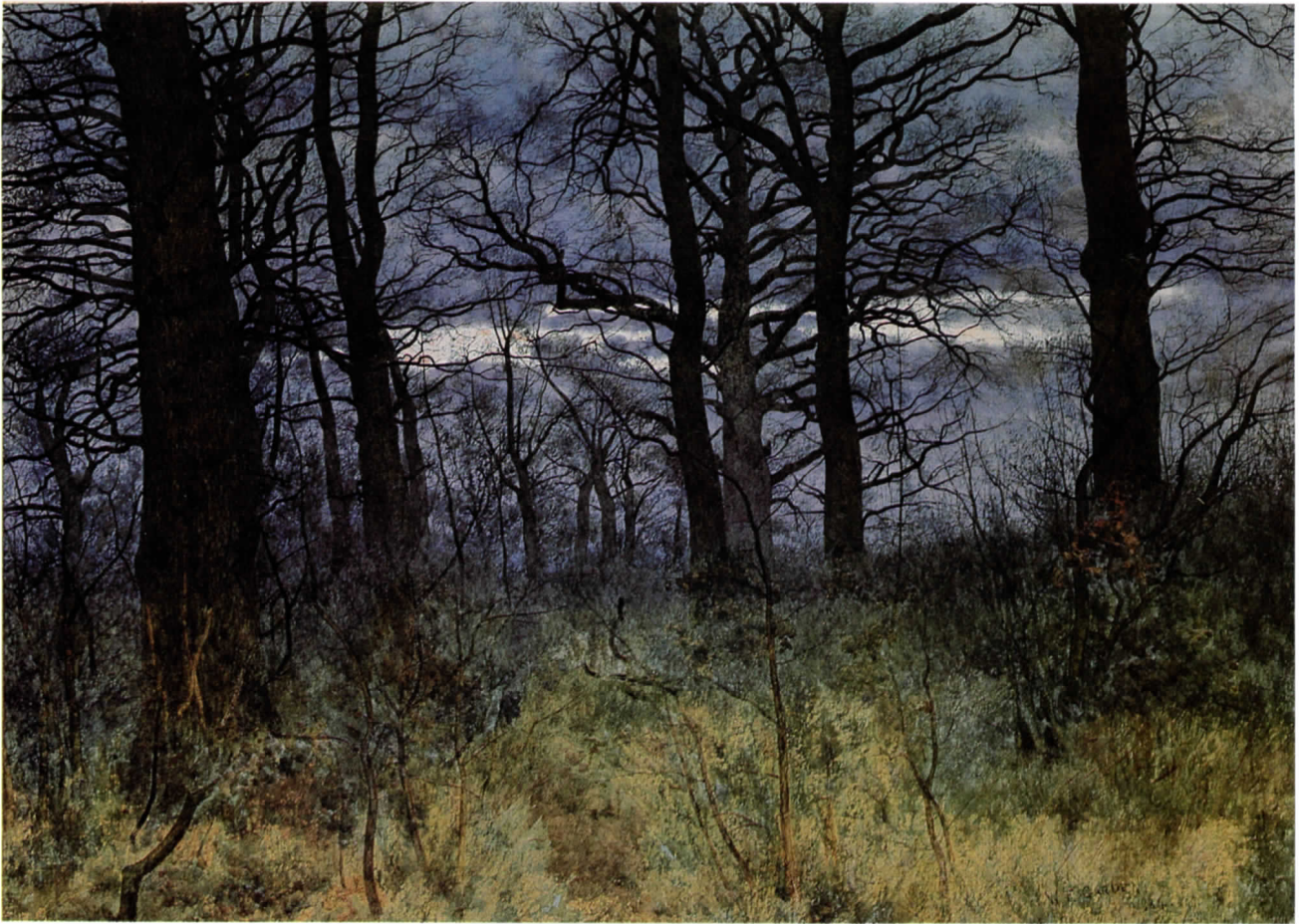
The Wood at Dusk . William Fraser Garden (1856–1921). Watercolor. Private collection.

Viewing the painting: How does this scene help you picture the setting of the story?