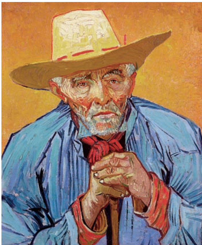
Portrait of Patience Escalier (1888), Vincent van Gogh. Oil on canvas. Private collection.