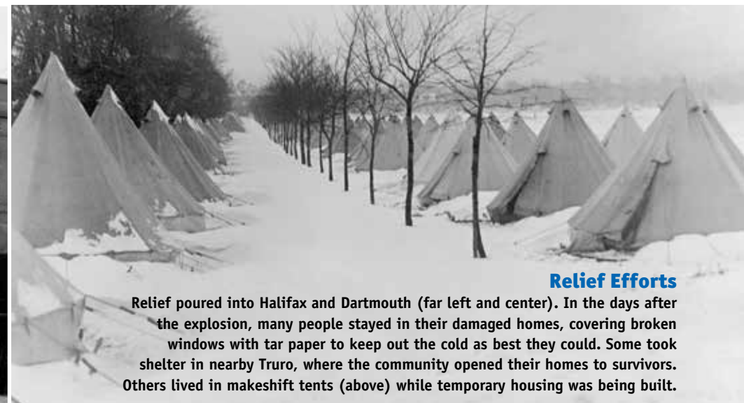
Relief Efforts Relief poured into Halifax and Dartmouth (far left and center). In the days after the explosion, many people stayed in their damaged homes, covering broken windows with tar paper to keep out the cold as best they could. Some took shelter in nearby Truro, where the community opened their homes to survivors. Others lived in makeshift tents (above) while temporary housing was being built.