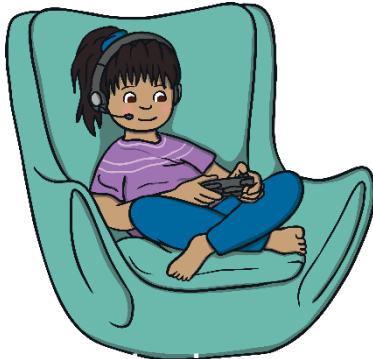
playing video games