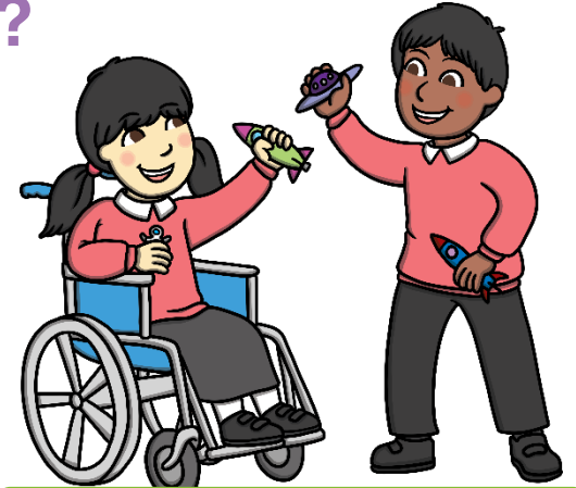
playing with friends