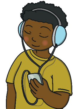
listening to music