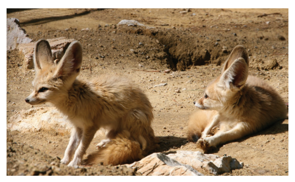
Figure 1 The large ears of a fennec fox act as "radiators" to dissipate thermal energy in the hot Sahara Desert.

You learned in the unit opener that Ray Zahab endured great physical strain as he raced across the extreme environment of the Sahara Desert. However, there are many animals native to the Sahara Desert that thrive in these conditions using special adaptations. One example is the fennec fox ( Vulpes zerda ) ( Figure 1 ). Its enormous ears serve two important functions that enable it to live in such a hostile habitat. First, the large ears enhance its hearing. This allows it to hear predators coming from far away, as well as hear prey, even when underground. The large ears also act as "radiators." As you learned in the Mini Investigation in the chapter opener, the greater the surface area is, the faster and more easily the temperature can be regulated downward. The fennec fox's radiator ears give it a large surface area to dissipate thermal energy faster. Maintaining an optimal internal temperature helps the fennec fox thrive in temperatures that range from below 0 °C to above 50 °C. The maintenance of the body's internal conditions is called homeostasis. In this unit, you will be examining homeostasis in animals.