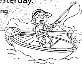
Simple Past Tense